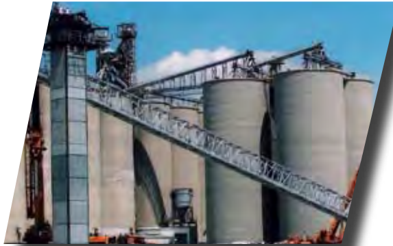
Storage capacity at our 12 regional facilities exceeds 30 million bushel.

The company supplies Midwest processing and southeast feeder markets, and also has international marketing experience.